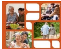
Supporting Tasmanian Carers Tasmanian Carer Action Plan 2021-25

https://www.dpac.tas.gov.au/divisions/cpp/community-policy-and-engagement/carers_policy_and_action_plan