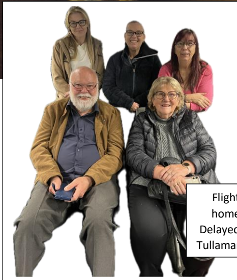
Flight home Delayed at Tullamarine