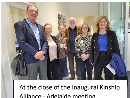
At the close of the Inaugural Kinship Alliance - Adelaide meeting.