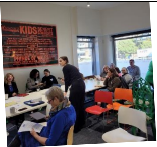
Mirabel Foundation in Melbourne.