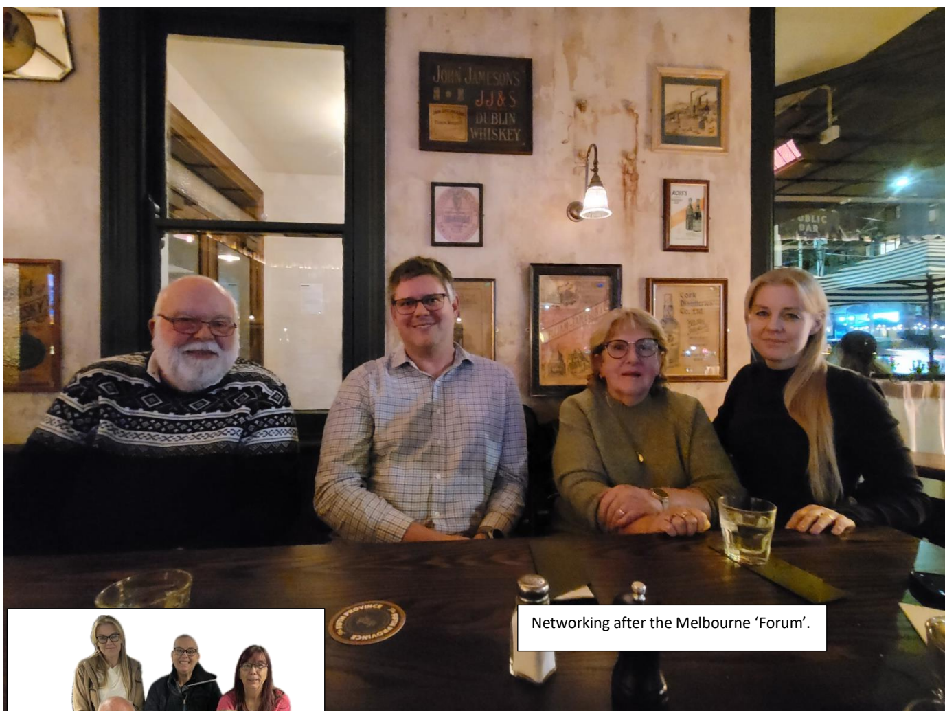
Networking after the Melbourne 'Forum'.